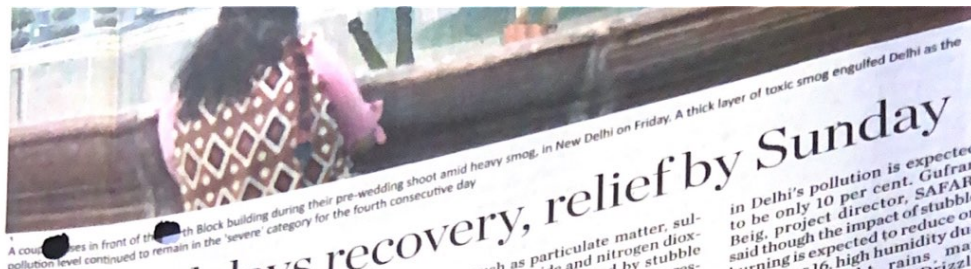
A couple poses in front of the South Block building during their pre-wedding shoot amid heavy smog, in New Delhi on Friday. A thick layer of toxic smog engulfed Delhi as the pollution level continued to remain in the 'severe' category for the fourth consecutive day

According to the Central Pollution Control Board data, the national capital saw 5 days each of very poor and severe air quality. On November 12, the AQI registered the severe zone (425) and has continued to deteriorate further.